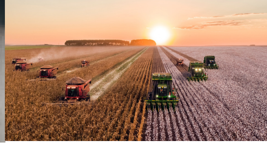
Theft detection (agricultural equipment)

EG-IoT 0A81 is a tracker that could travel and operate in all countries due to its classic cellular connectivity technology. It could gather several environmental informations based on BLE transmission technology.